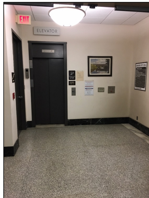
Third Floor Area of Refuge

If you are unable to evacuate the building during an emergency event, employees are encouraged to report to an area of refuge. They are located in the basement and on the second and third floors of the buildings, near the elevator. During a fire event, make sure the fire doors to the hallway and staircase are closed. This will prevent smoke from entering the shelter area. Push the 3 inch diameter, stainless steel button labelled "Push for Help". This will notify the 911 dispatcher that someone needs assistance in the City Hall area of refuge. The dispatcher will notify the first responders at the scene of your location and that you need assistance with evacuating. First responders will arrive shortly to assist you.