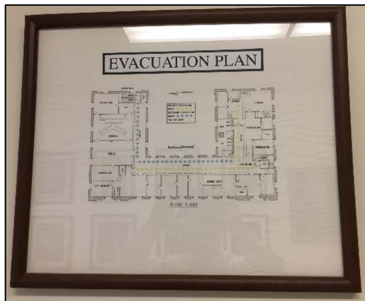
City Hall Evacuation Map

When the fire alarm system is activated, occupants are required to immediately evacuate the building. The primary route for evacuation should be followed unless an unsafe condition blocks