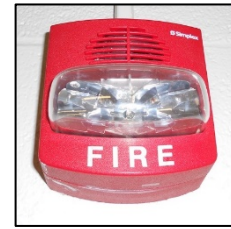
Fire Alarm Strobe Light

hear or see a fire alarm, never assume the alarm is a false alarm. Immediately evacuate the building and report to the designated assembly area. There are two ways the fire alarm system can be activated, by a smoke detector or through an alarm pull station located near the exits of the building. If an employee uses an alarm pull station to activate the alarm, he or she should immediately evacuate the building and call 911 from a safe location to report the emergency.